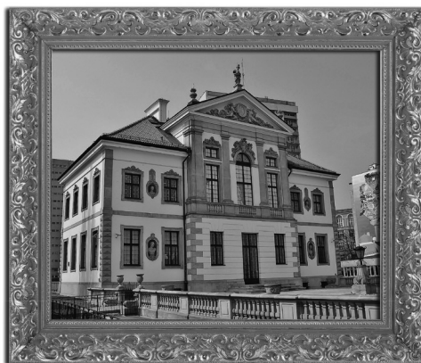
Muzeum Fryderyka Chopina Zamek Ostrogskich w Warszawie